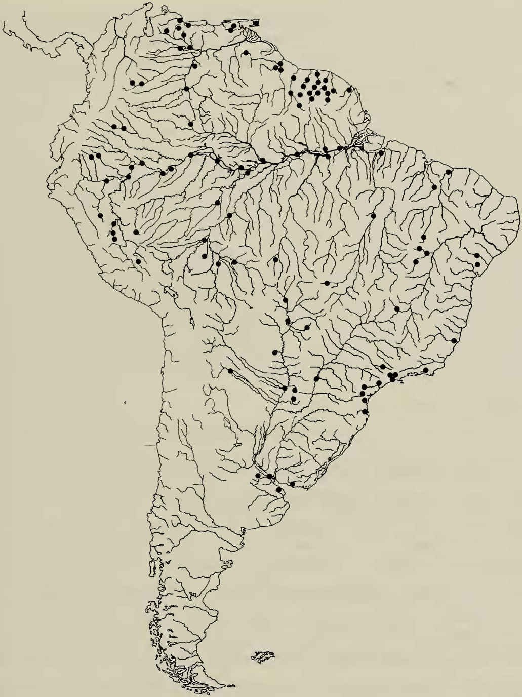
Fig. 5. Distribution of Corydoras based upon reports in the literature. Doubtful or non-specific localities have been excluded. Although Nijssen (1970:59, Fig. 35) indicates Corydoras from the Rio Magdalena in Colombia, this locality may be in error (e.g. see Eigenmann, 1923:65, 220, 228; Miles, 1947:100).

era was restricted to southern and eastern Brazil. That specimens of A. pauciradiatus have now been found in the upper central portion of the Amazon basin brings these authors' statements concerning the distribution and relationships of Aspidoras and Corydoras into question.